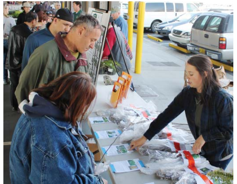
This year's Arbor Day Celebration will take place on March 21 st at the Farmer's Market in Raleigh.

For more information, you can go online and visit: go.ncsu.edu/arborday2015 . ■