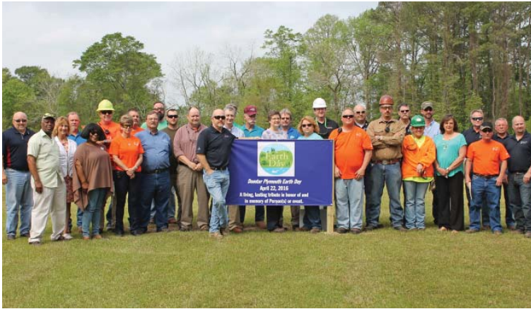
Domtar Celebrates Earth Day! Domtar in Plymouth commemorated Earth Day by planting pine seedlings in honor of past employees, children of employees and out of respect to the men and women of our Armed Forces across the globe. The five departments were represented by employees. Testimonies were provided prior to the planting. The NCFA was honored to be invited to this tribute celebration!

Please register by May 2 at (919) 917-8646 or nctreefarm@gmail.com. ■