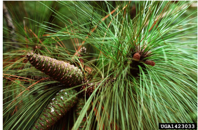
Longleaf pine needles and cones.

Figure 2 shows the change in number of longleaf pine trees by diameter class distribution over time. Between 1974 and 2002, longleaf pine trees decreased dramatically in the 4– through 10– inch diameter classes. Between 1990 and 2002 the number of trees 2– inches and smaller decreased as well. However, regeneration efforts show a marked increase in number of small trees from 2007 forward, with gains up to the 6– and 8– inch classes beginning to show by 2015.