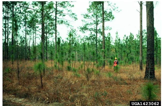
Longleaf pine regeneration